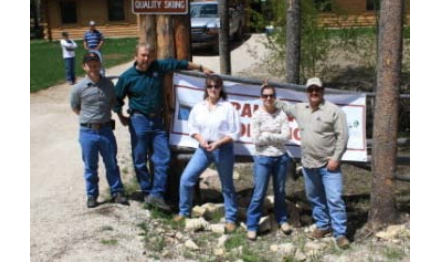
Rural Living Team

Facilitate community meetings for distribution of information on new conservation implementation options (i.e. solar panel utilization, high tunnel gardening).