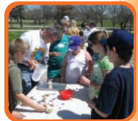
Students participate in "H2O Olympics" to learn about cohesion and adhesion of water molecules with a festival volunteer at the Franklin County EARTH Festival in Kansas.

Launched by Kansas State University Research and Extension, Earth Awareness Researchers for Tomorrow's Habitat (EARTH) focuses on environmental education during a year-long middle school program. Conservation districts in more than a dozen counties promote EARTH and its curriculum to schools and youth programs statewide. The mission is "to provide youth with innovative, experimental learning opportunities that highlight the relationships and interdependence of our natural resources." The Franklin County Conservation District provides curriculum books and supply kits to four school districts. The kits include supplies necessary to complete more than 30 hands-on lessons that explain the relationships and interdependency of soil, water, air and living resources. The program culminates with an EARTH Festival in April, where environmental professionals volunteer and provide engaging activities for the students related to the curriculum topics. For information, contact Keri Harris at keri.harris@ks.nacdnet.net .